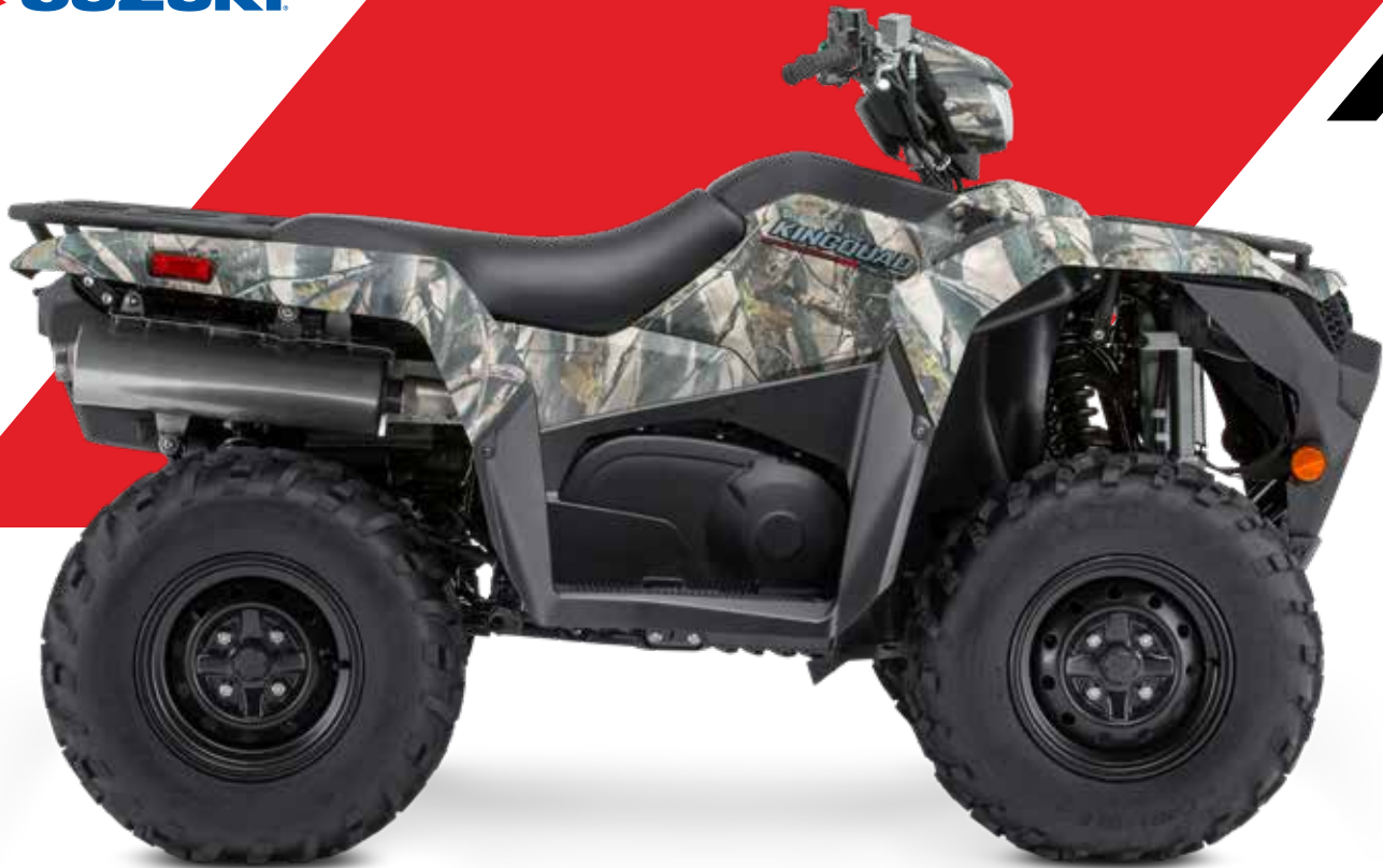
TRUE TIMBER XD3 (KINGQUAD 750AXI POWER STEERING CAMO)