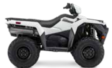
SOLID SPECIAL WHITE NO. 2